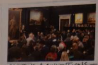
= MEETINGS & CONVENTIONS =